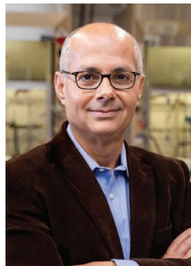
Omar M. Yaghi

Born: 4 June 1937, Glusburn, United Kingdom Affiliation at the time of the award: University of Melbourne, Melbourne, Australia